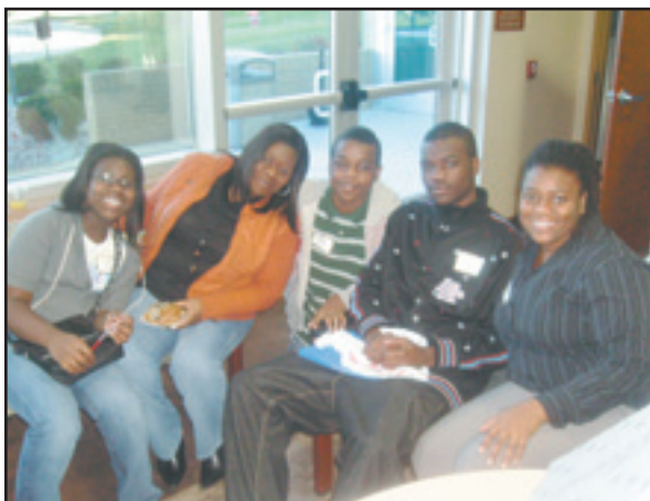
Dooley Family members