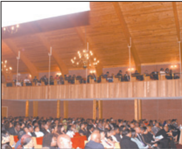
More family friends