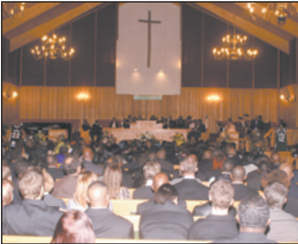
Funeral service attendees from all walks of life