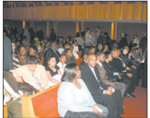
Family members nieces, nephews, children and grandchildren