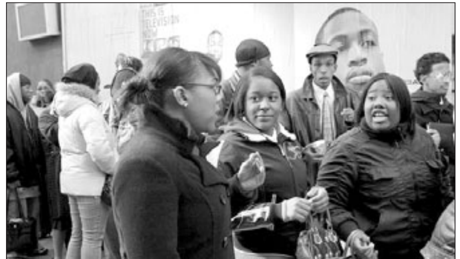
The recession has caused hardship for all Americans, but minorities have been hit particularly hard by these difficult economic times.

These differences have shrunk slightly because inflation-adjusted earnings for Hispanics gained slightly in the last business cycle, from March 2001 to December 2007, while those for whites were flat in the last business cycle and dropped sharply in the current recession. Between the first quarter of 2001 and the fourth quarter of 2007, the usual median weekly earnings of Hispanics in 2007 dollars grew at an average annualized rate of 0.6 percent, while whites' earnings declined at an average annualized rate of 0.03 percent. Once the recession hit, Hispanics actually saw a bump in their earnings, which grew by