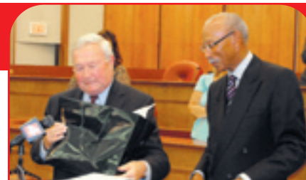
Oakland County Executive L. Brooks Patterson Makes Presentation to New Mayor of Detroit Dave Bing at OC Board of Commissioners Meeting on September 2