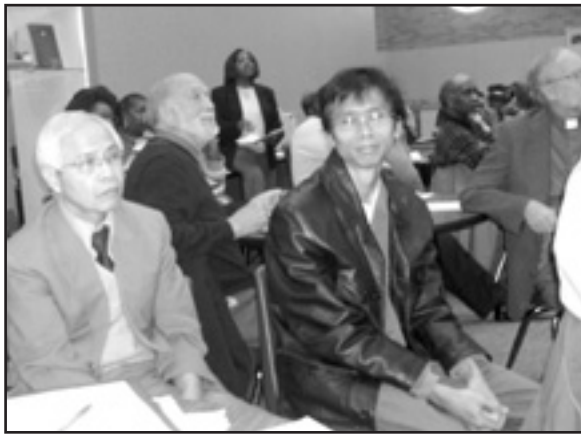
Members of Community