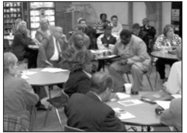
Members of Community