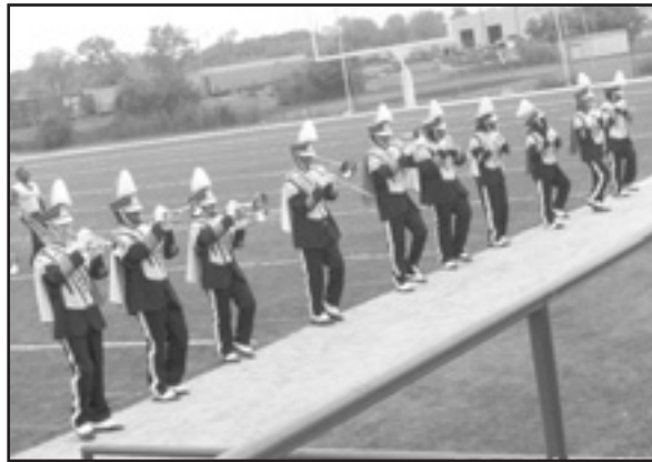
Pontiac Northern High School Band