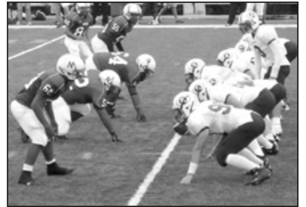
Football Team in Action