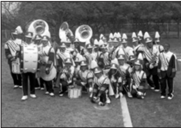
Pontiac Northern High School Band