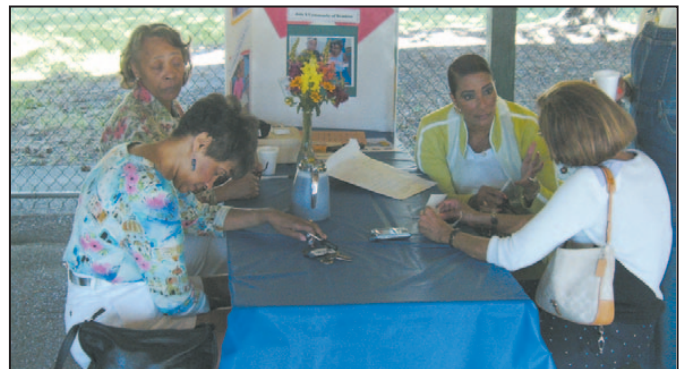
Pancake Breakfast - Friends of Pontiac Library Foundation